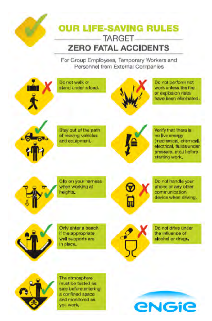
Figure 1.4 (2): In North American operations, plant personnel must respect 43 health and safety procedures and all workplaces must comply with OHSAS 18001

ENGIE is committed to providing a workplace free from offensive or harassing conduct. To meet that commitment, ENGIE depends on all employees conduct themselves to in conformance with its expectations of a harassment-free work environment cooperate with investigations of non-compliance with this policy, as required and permitted by law.